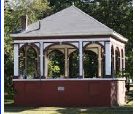
O'Connell South Common Band Stand Market & S. Union St.

Music, Public Safety Demonstrations Bounce House, Face Painting, Magician L.F.D. Smoke House, State Police Rollover Car (Hamburgers, Hot Dogs and more available at a nominal charge) Enjoy with family, friends, neighbors