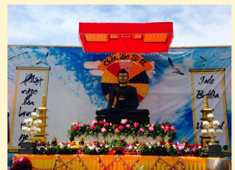
The Jade Buddha Statute