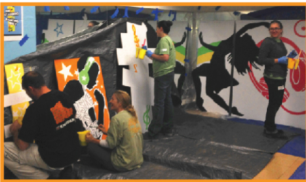
BEACON BOYS & GIRLS CLUB SITE

Timberland Employees adding some color to the club with new murals