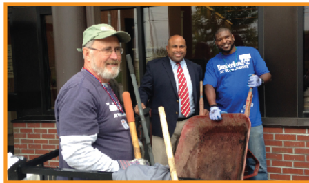
COR UNUM SITE

Timberland Employees adding some color to the club with new murals