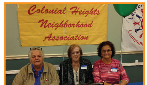
Colonial Heights Neighborhood Association