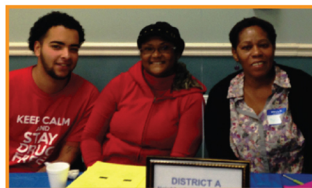
District A Neighborhood Association