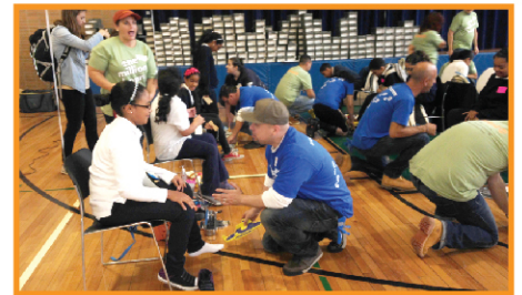
BRUCE SCHOOL SITE