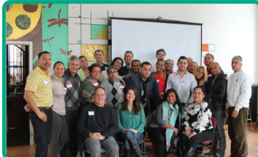
Latino Entrepreneurs at the Negocios Exitosos Conference