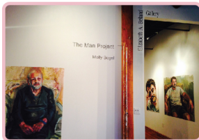
The Man Project at Essex Art Center