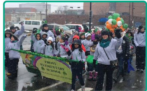
Some happy faces of the Frost Elementary School students marching down Amesbury St.