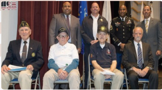
City of Lawrence Veterans Day held at the South Lawrence East School.