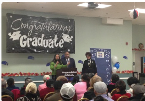
Congratulations to the class of 2015 for their hard work and dedication in courses such as Basic English, Computers, and Arts and Crafts.