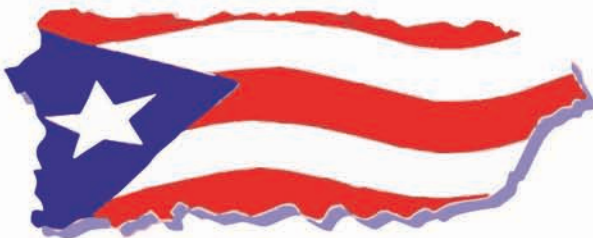
Photo Caption: Mayor Dan River celebrated a festive holiday evening at the 3rd annual Jolgorio Puertorriqueño.