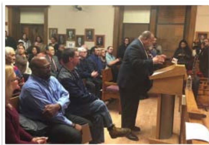
Photo Caption: Mayor Daniel Rivera gives the State of the City in front of City Council on 2/7/2017.