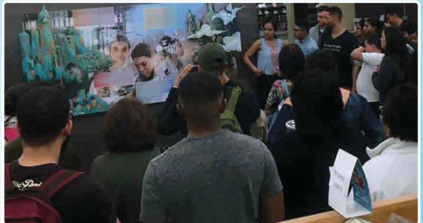
LYC Members along with members of the Elevated Thought Group unveil their Mural at the Lawrence Public Library which is located on the 2nd floor.