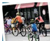
Wet N' Ride